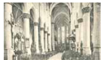
Interno della chiesa