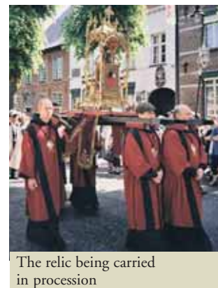
The relic being carried in procession