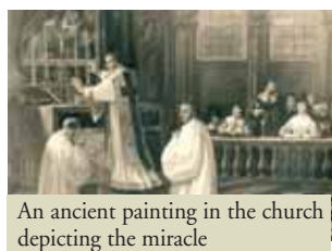
An ancient painting in the church depicting the miracle