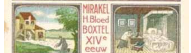
The Eucharistic miracle took place at St. Peter's Church in Boxtel