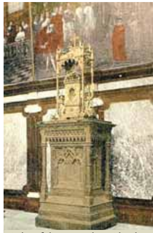
Relic of the miraculous Blood, St. Catherine's Church