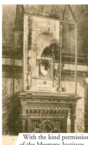
With the kind permission of the Meertens Institute