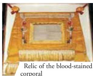
Relic of the blood-stained corporal