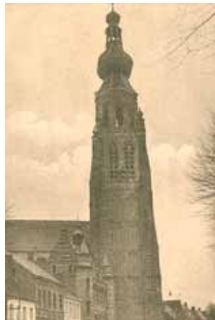
Exterior of St. Catherine's Church, Hoogstraten