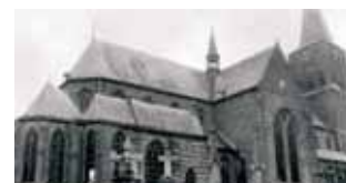
Il Miracolo Eucaristico si verificò nella chiesa di San Pietro a Boxtel