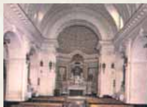
Inside of the church

On the night of July 25, 1969, some thieves broke into the parish church of San Mauro la Bruca with the intention of stealing some of the more precious objects. After they had pried open the tabernacle, they took a ciborium containing many consecrated Hosts. Once they left the church, the thieves emptied the ciborium and threw the Hosts on a footpath. On the following morning a child noticed the pile of Hosts at the intersection of the road and gathered up the Holy Eucharist, immediately giving the Hosts to the pastor. It was only in 1994, after 25 years of detailed analysis, that Msgr. Biagio D'Agostino, Bishop of Vallo della Lucania, acknowledged the miraculous preservation of the Hosts and authorized the cult. The conclusion of any chemical and scientific analysis acknowledges that after just 6 months wheat flour severely deteriorates and in a few years turns gelatinous and then, finally, to dust.