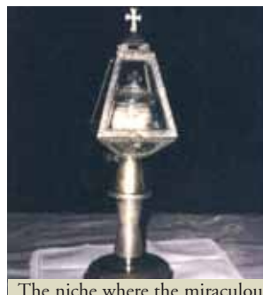
The niche where the miraculous Hosts are preserved