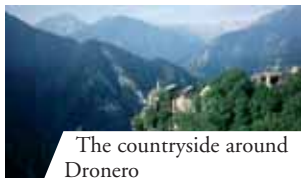
The countryside around Dronero