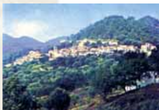
View of San Mauro la Bruca