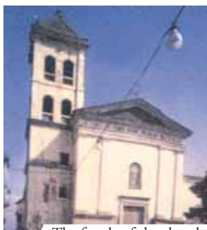
The façade of the church of San Mauro