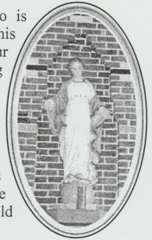
N-Dame du Sourire

Our parish, which was first in North America to be given St. Theresa of the Child Jesus as our patron Saint, has approximately 30 000 parishioners, mostly young families. Hundreds of people come to the chapel each week to adore our Eucharistic Jesus, to present their personal petitions to Him and to pray for their loved. We already note a remarkable renewal of fervor in our beautiful parish.