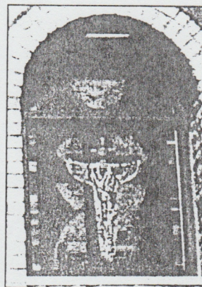
Stained-glass window (outside)