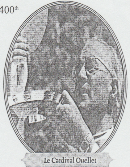
Le Cardinal Ouellet